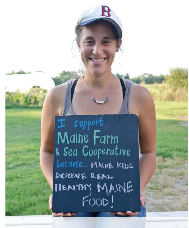
CDI helped promote local food in Maine.

Our revenues come about half-and-half from program income and grants, and are just enough to cover expenses.